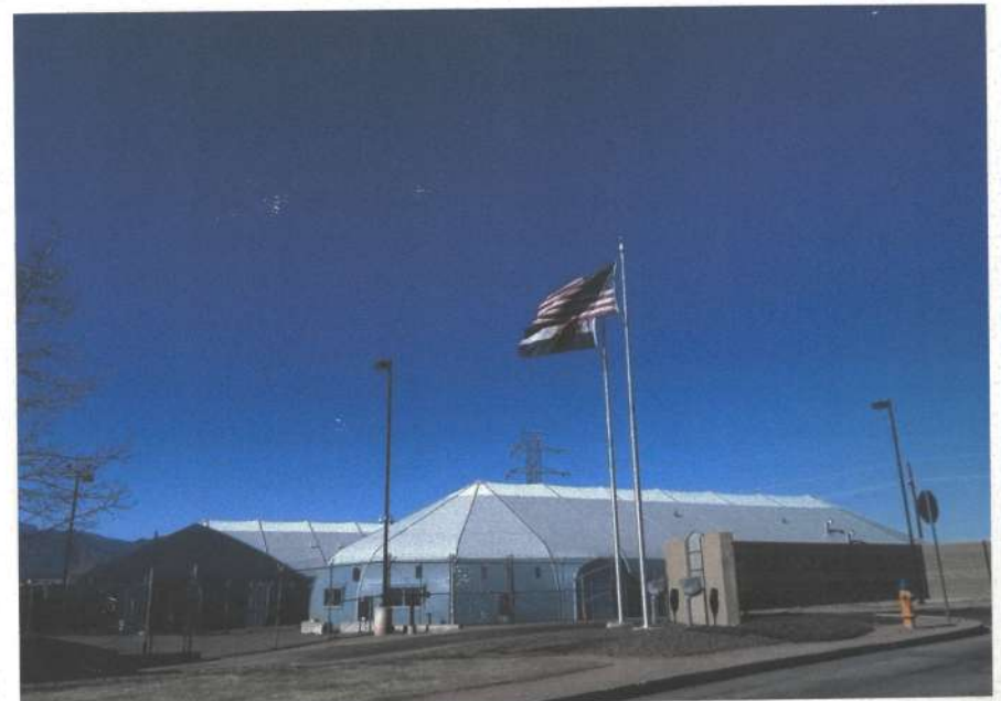
El Paso County Criminal Justice Center is operated by Immigration and Customs Enforcement in Colorado Springs, Colorado.