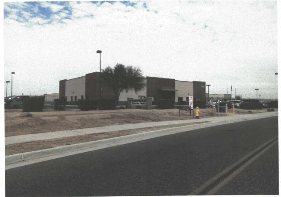
Imperial Regional Detention Facility is operated by Management & Training Corporation MTC in Calexico, California.